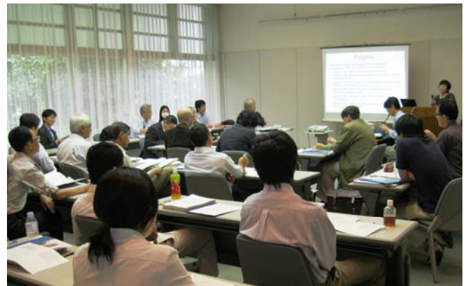
The scene of a session

On September 23-24, 2011, we held our first international workshop of PRIMCED. The workshop was titled "Advancing Knowledge in Developing Economies and Development Economics: Towards the Understanding of Institutions in Development" and its venue was Sano Shoin, Hitotsubashi University. The workshop was co-organized and co-sponsored by (i) The Department of Economics, the School of Oriental and African Studies, the University of London (SOAS), (ii) The Center for Economic Institutions, Hitotsubashi University (CEI), and (iii) Grant-in-Aid for Scientific Research-S, "Poverty Reduction, Institutions, Markets, and Policies in Developing Countries: Toward a Theory of Comparative Economic Development" (PRIMCED).