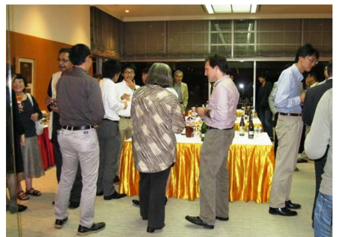
The scene of the reception

In conclusion, the purposes of this workshop were successfully met. The discussions were so excited that chairs often had difficulty in closing their sessions. Not only during sessions but also during the reception, coffee, and lunch breaks, the participants actively exchanged their research ideas. We hope we can continue this exchange in future workshops to follow. Some of papers presented at the workshop are forthcoming as part of the PRIMCED discussion paper series.