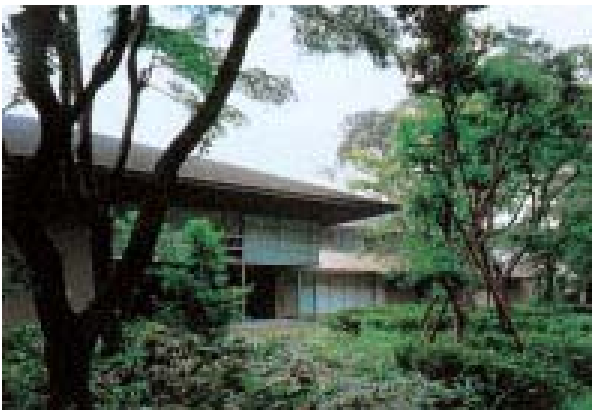
Sano Shoin, Hitotsubashi University

The goal of the PRIMCED project is the synthesis of knowledge on poverty reduction, economic institutions, markets, and policies in the process of economic development. Our main fields are Asian and African countries, and pre-war Japan. The three major pillars of our approach are (i) microeconomic analysis of original microdata collected in contemporary developing countries, (ii) comparative historical analysis of economic development using both micro and macro data, and (iii) combining the two through quantitative empirical analyses with similar specifications for both contemporary and historical cases as well as through model building. As part of this effort, this workshop was intended for two purposes: (i) sharing information on the research results conducted by fellow researchers, and (ii) discussing the future direction of the project toward unified research goals.