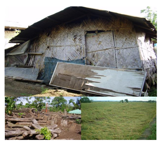
Milenyo hit Hayami Village

that traditional relationships among villagers are at a crossroads. In what direction are the villagers going? I hope the answer will become clearer as we continue the ongoing PRIMCED research regarding flood damage.